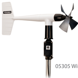
05305 Wind Monitor-AQ