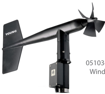
05103-45 Alpine Wind Monitor