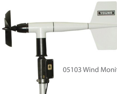
05103 Wind Monitor

All of the Wind Monitors use a potentiometer to measure wind direction. The datalogger applies a known precision excitation voltage to the potentiometer element. The output is an analog voltage signal directly proportional to the azimuth angle.