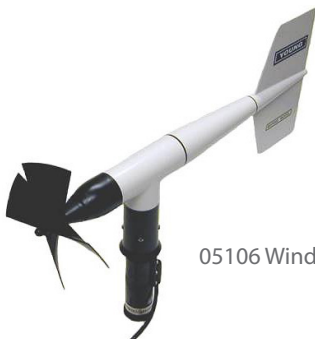
05106 Wind Monitor-MA