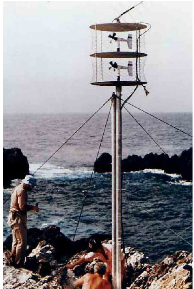
An innovative method of discouraging interference from birds was used at a station at St. Peter and St. Paul Rocks (Brazil).